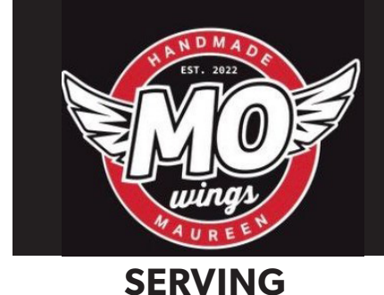
SERVING AWARD WINNING MO'S WINGS!

Dignity Food Trucks offer students hands-on experience using their skills from the culinary training program. The food trucks sell award-winning food at local community events, as well as responding to natural disasters throughout the country providing food relief. With two food trucks in operation, culinary students gain confidence working with the public while completing their certification in the training program.